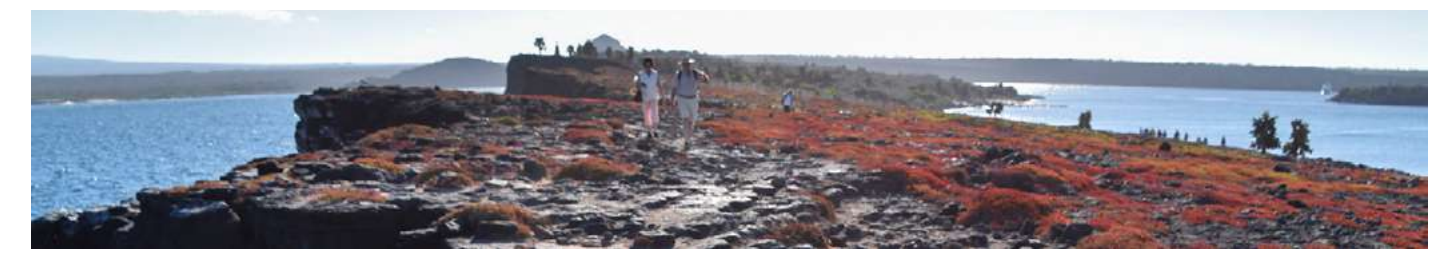
DAY 1 - MONDAY am – Baltra Airport

Departure from Quito or Guayaquil to Baltra Island (2 ½-hour flig t). Arriving in the Galapagos, passengers are picked up at the airport by our natural guides and taken to a ten-minute bus drive to the pier to board the <sup>M/V</sup>Galapagos Legend.