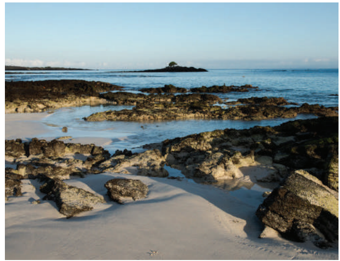
am – Baltra Airport

Difficulty level: easy Type of terrain: sandy Duration: 1-hour walk / beach time